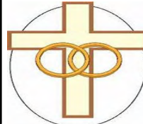
Sacrament of Marriage

Attention Adults, Older Teens Have you expressed an interest in becoming a Catholic? Baptized in an other Christian church? or were baptized Catholic but have not received First Communion or Confirmation? We offer you an opportunity to come together in a small group to learn about our faith. Sessions meet on Sunday mornings after the 11AM Liturgy. Interested?? Please call the rectory at 718-451-1500 and leave your name, phone number, email address or email at: sttheresereled@hotmail.com