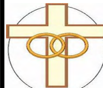
Sacrament of Marriage