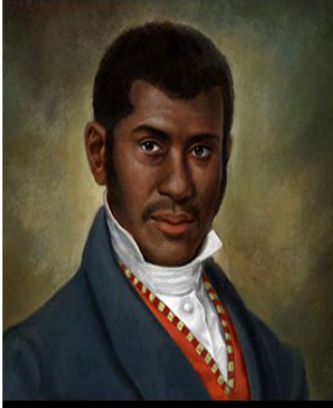
Venerable Pierre Toussaint

Venerable Pierre Toussaint (1766-1853) was born a slave in Haiti and died a freeman in New York City. He is credited by many with being the father of Catholic Charities in New York. Pierre was instrumental in raising funds for the first Catholic orphanage and began the city's first school for black children. Ven. Pierre Toussaint was a slave whose owners moved to New York. He was educated and made his own money as a hairdresser, even caring for his owners when they could not care for themselves. His owner freed him after she died in 1807.