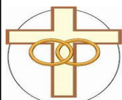
Sacrament of Marriage

Marriage arrangements must be made at least six months prior to the wedding date. Please contact the rectory for complete information about marriage preparation in the Diocese.